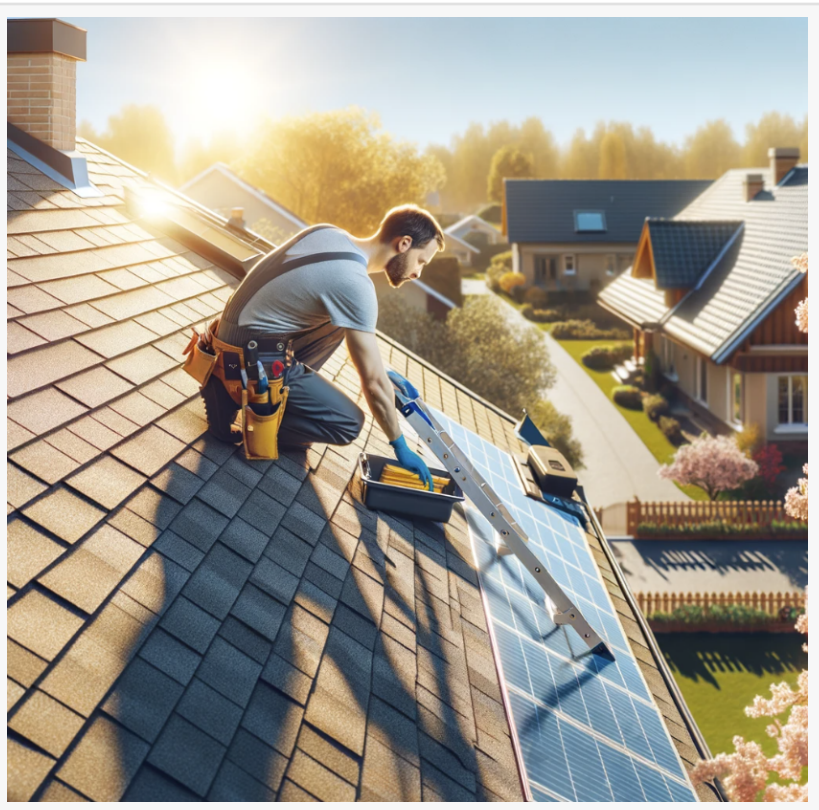
Intelligent Design Air Conditioning, Plumbing, Solar, & Electric Solar Installation in Tucson

Because these problems are hidden, homeowners need to do more than just look at the roof. They should take a thorough look at both what they can see and what they can't. This means checking all parts of the roof, even the ones that are hidden from view. Doing a complete assessment like this is really important to find any hidden damage and stop it from causing problems for the safety of the home. By carefully looking at every part of the roof, homeowners can catch issues