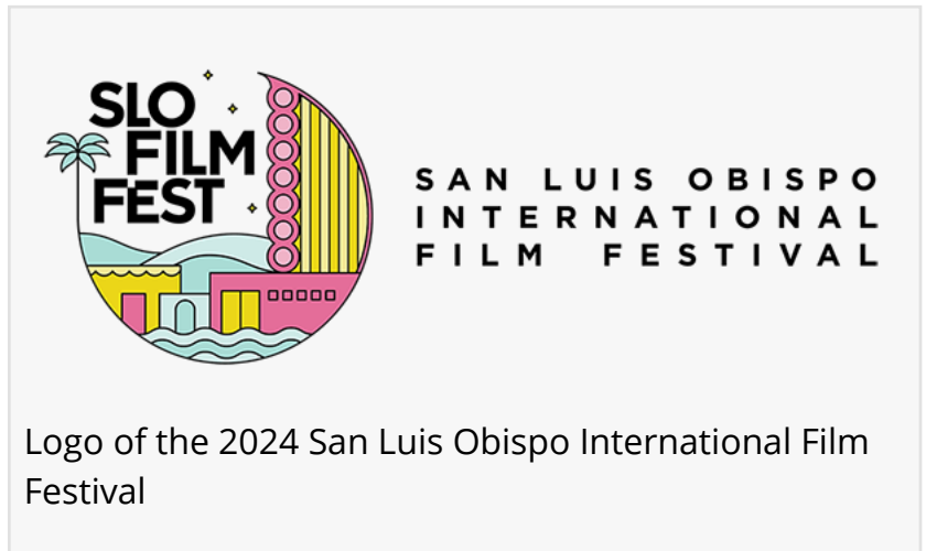
Logo of the 2024 San Luis Obispo International Film Festival

Both the Palm Theatre and the SLO Film Festival have long played key roles in the region. Jim