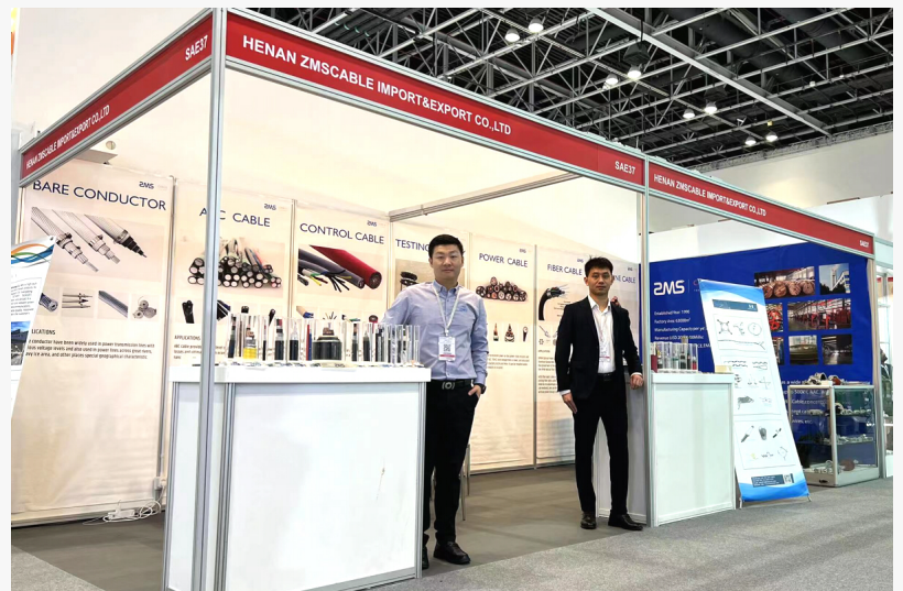
ZMS at the Exhibition