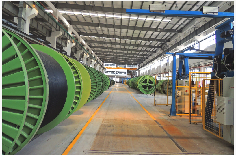
ZMS Cable Factory