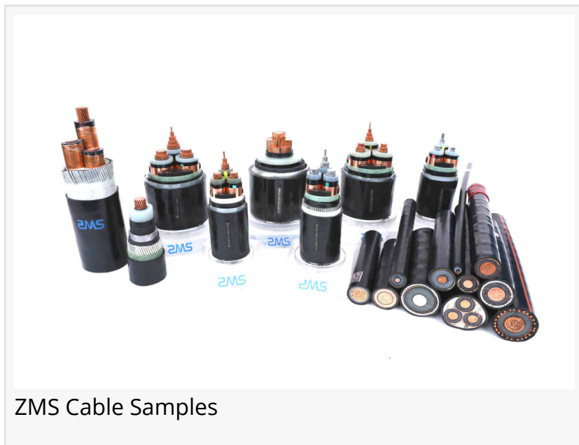
ZMS Cable Samples

ZMS Cable is pleased to confirm its representation at the forthcoming 11th Power & Energy Africa exhibition in Kenya. It will be represented by a dedicated team of five seasoned sales professionals specializing in the African market. These professionals bring with them a wealth of expertise and industry knowledge, poised to provide visitors with tailored cable solutions to meet their specific needs.