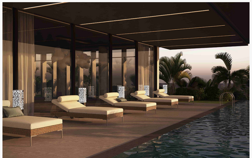
The Prefab Technology