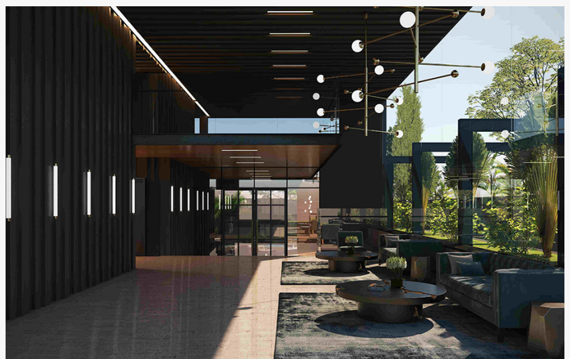
ARBT Property Group Pty Ltd