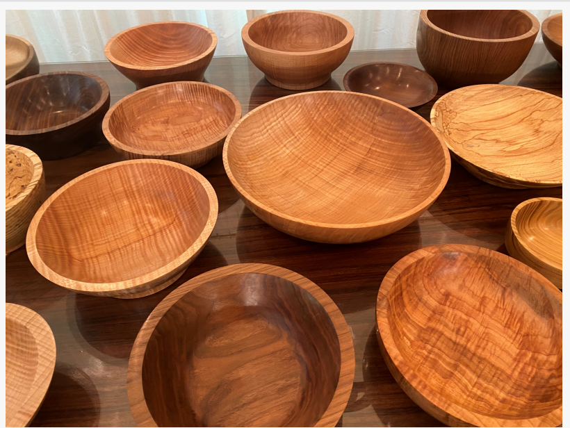
Talking Wood Bowls

CANTON, GEORGIA, UNITED STATES, May 14, 2024 /EINPresswire.com/ -- Talking Wood Studio today announced the international expansion of its online store. This milestone is a major move for Talking Wood Studio in its mission to adorn the world's finest tables.