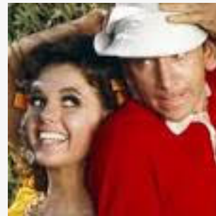
Dawn Wells and Bob Denver on set on Gilligan's Island