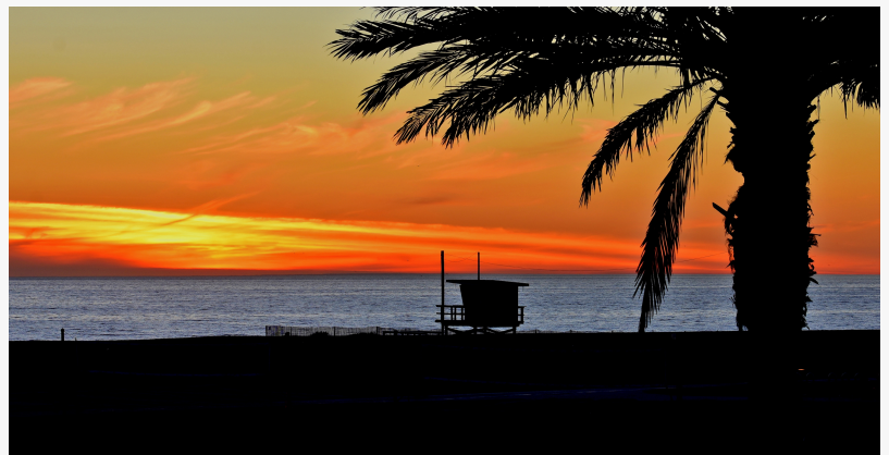
The Spectacular Setting for Summit XII

LOS ANGELES, CA, UNITED STATES, May 14, 2024 /EINPresswire.com/ -- The Information Systems Security Association (ISSA) Los Angeles Chapter (ISSA-LA) is excited to announce that it is currently seeking speakers and sponsors for its highly anticipated annual events. The CISO Forum on September 25th and the Security Summit on September 26th, 2024, are two of the most prestigious events in the cybersecurity and IT industry, drawing in hundreds of leading professionals for two packed days of thought-provoking discussions, networking, and learning. This year's events will be held at a stunning