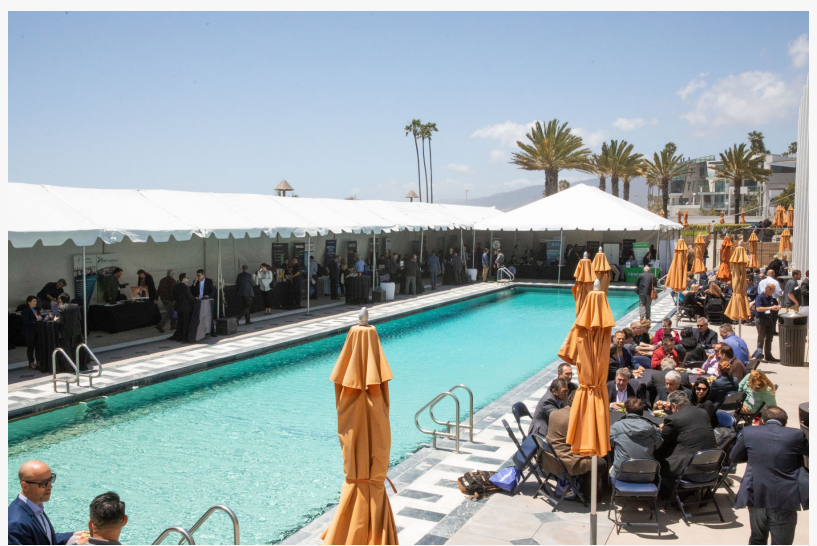
Beautiful Pool and Sponsors

The Information Systems Security Association Los Angeles (ISSA-LA (r)) is a leading organization for information security professionals and practitioners. As a non-profit organization, we are dedicated to enhancing the knowledge, skills, and professional growth of the cybersecurity and IT community through educational forums and peer interaction opportunities. We provide educational forums and peer interaction opportunities that enhance the knowledge, skill and professional growth of the Cybersecurity and IT Community. The Los