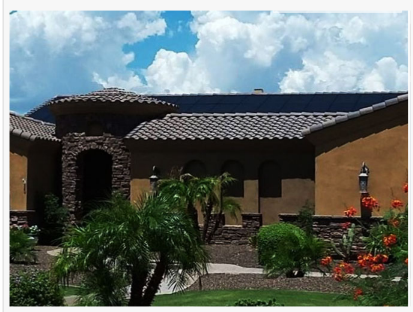
ASW Residential Solar

electric grid outages. Arizona Solar Wave serves communities throughout Arizona. For more information, go to arizonasolarwave.com