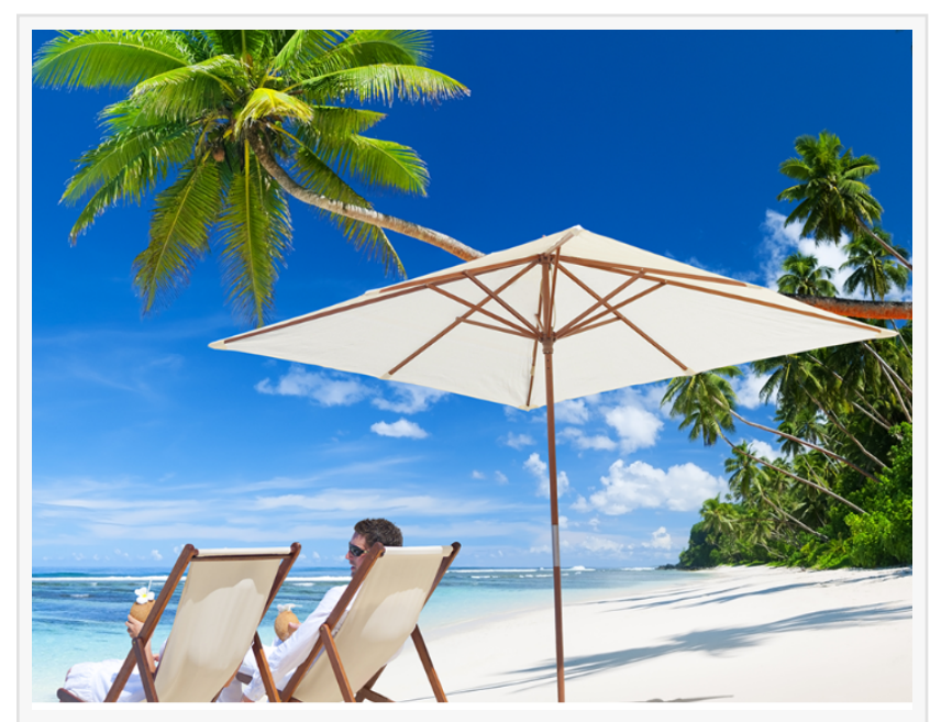
ASW Vacation for survey answers

Arizona Solar Wave's consultative process strives to help residential homeowners attain the best return on investment as they transition from fossil fuels to solar energy. Their highly trained advisors assist customers to size the solar system to custom fit their home, explore several financing options, and make a recommendation based on the customer's best interests, discuss tax credits that may be available, and highlight the expected short, medium, and long-term savings — even the effect that solar may have on their property value. By switching to solar, customers enjoy more predictable energy costs and, with a backup battery, add resiliency against