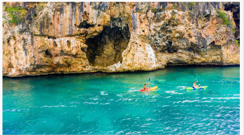
Kayaking in Little Bay, Anguilla