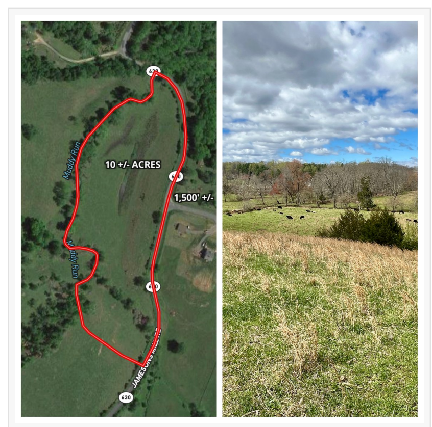
12038 Jamesons Mill Rd., Culpeper, VA 22701

This press release can be viewed online at: https://www.einpresswire.com/article/711560156 EIN Presswire's priority is source transparency. We do not allow opaque clients, and our editors try to be careful about weeding out false and misleading content. As a user, if you see something we have missed, please do bring it to our attention. Your help is welcome. EIN Presswire, Everyone's Internet News Presswire™, tries to define some of the boundaries that are reasonable in today's world. Please see our Editorial Guidelines for more information. © 1995-2024 Newsmatics Inc. All Right Reserved.