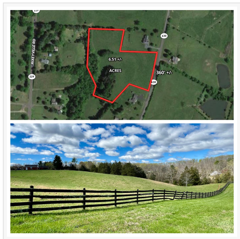
12038 Jamesons Mill Rd., Culpeper, VA 22701