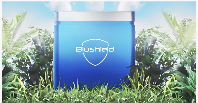
B1 Ultimate EMF Protection