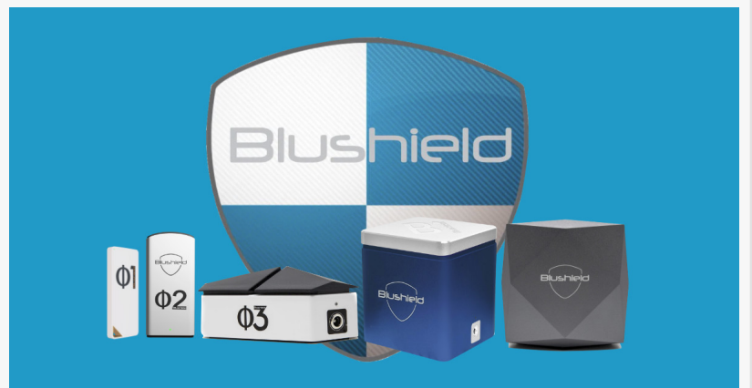
Discover the Blushield Range of EMF Protection

products are now available to UAE residents and businesses seeking innovative solutions to safeguard their health and well-being from Wi-Fi, 5G, and other electronic emissions.