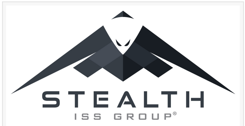
Stealth-ISS Group Inc

A complete package of services and technologies called CMMC-in-a-Box makes it easier to achieve CMMC compliance. It has all the resources, tools, and advice required to assist companies in navigating the intricate requirements and obtaining the required level of