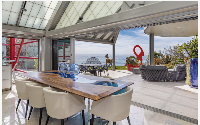
41800 East Pacific Coast Highway, Malibu, California