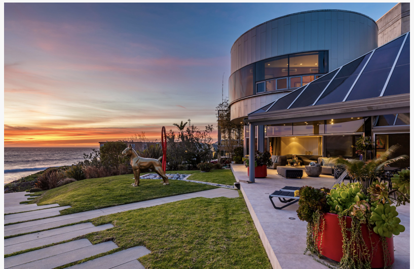
41800 East Pacific Coast Highway, Malibu, California