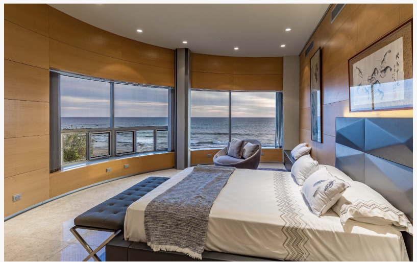
41800 East Pacific Coast Highway, Malibu, California

Concierge Auctions is the world's best luxury real estate auction marketplace, with state-of-the-art digital marketing, property preview, and bidding platform. The firm matches sellers of one-of-a-kind homes with some of the most capable property connoisseurs on the planet. Sellers gain unmatched reach, speed, and certainty. Buyers receive curated opportunities. Agents earn their commission in 30 days. Acquired by Sotheby's, the world's premier destination for fine art and luxury goods, and Anywhere Real Estate, Inc (NYSE: HOUS), the largest full-service residential real estate services company in the United States, Concierge Auctions continues to operate independently, partnering with real estate agents affiliated with many of the industry's leading brokerages to host luxury auctions for clients. For Sotheby's International Realty listings and companies, Concierge Auctions provides Sotheby's brand exclusivity as Sotheby's Concierge Auctions. Since inception in 2008, the firm has generated billions of dollars in sales, broken world records for the highest-priced homes ever sold at auction and conducted auctions in 46 U.S. states and 38 countries. The firm owns one of the most comprehensive and intelligent databases of high-net-worth real estate buyers and sellers in the industry, and it has committed to build more than 300 homes through its Key For Key® giving program in partnership with Giveback Homes™, which