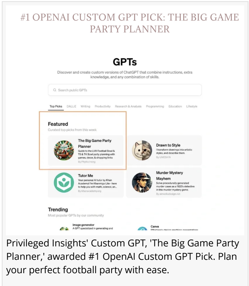
Privileged Insights' Custom GPT, 'The Big Game Party Planner,' awarded #1 OpenAI Custom GPT Pick. Plan your perfect football party with ease.

Privileged Insights: Leading the Charge from Day One