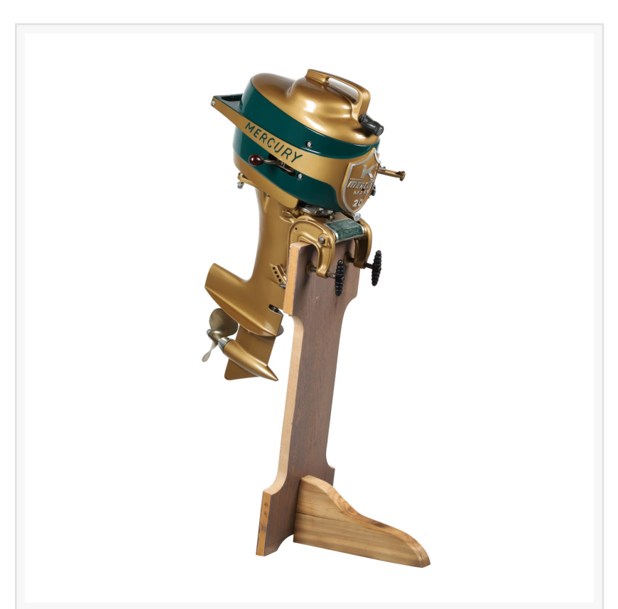
American 1950s 16 hp Mercury Mark 20 racing boat motor with Quickie Prop lower unit – the holy grail for collectors, with a low serial number (CA$8,850).

This press release can be viewed online at: https://www.einpresswire.com/article/711853677 EIN Presswire's priority is source transparency. We do not allow opaque clients, and our editors try to be careful about weeding out false and misleading content. As a user, if you see something we have missed, please do bring it to our attention. Your help is welcome. EIN Presswire, Everyone's Internet News Presswire™, tries to define some of the boundaries that are reasonable in today's world. Please see our Editorial Guidelines for more information. © 1995-2024 Newsmatics Inc. All Right Reserved.