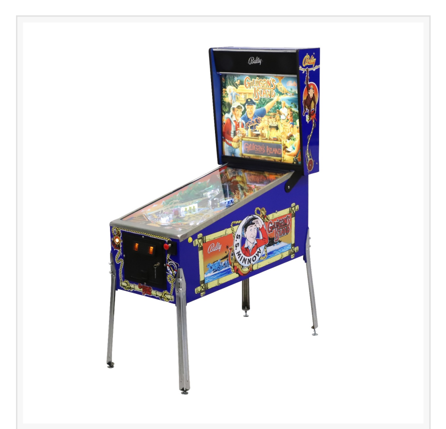
Bally Gilligan's Island pinball machine made in America in 1991 and fully restored. The early, soughtafter machine plays the theme song from TV's Gilligan's Island (CA$10,030).

An early and exquisite John H.R. Molson and Brothers single-sided porcelain Montreal India Pale Ale corner sign (Canadian, 20th century),