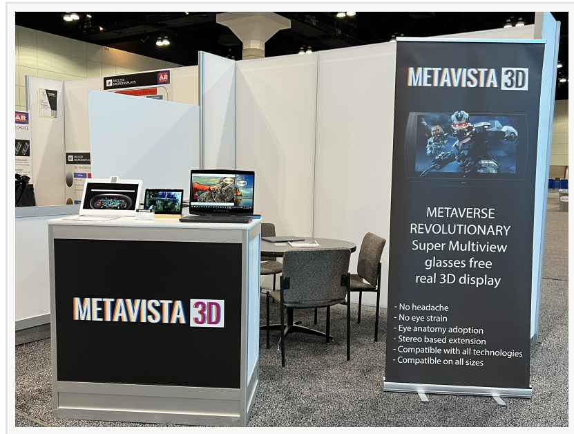
3D Demo at Metavista3D booth

Be sure to visit Metavista3D at SID Display Week 2024 to get an up-close look at the company's innovative 3D display technology and learn more