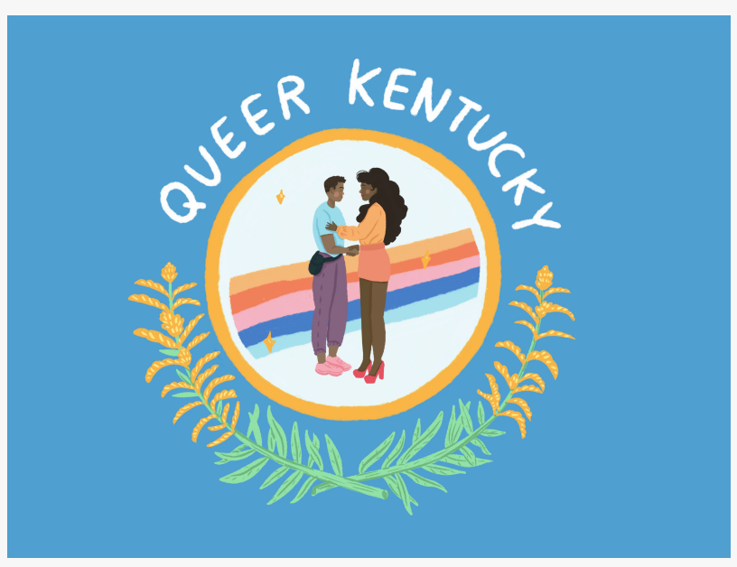
Queer Kentucky Strives for Inclusivity and Visibility for the Queer Community

This press release can be viewed online at: https://www.einpresswire.com/article/711870965