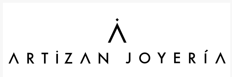
Artizan Joyeria Logo

'REBORN' embodies the empowerment that comes from changing, adapting, and growing, no matter the circumstances. "We wanted to celebrate women's innate ability to change," adds