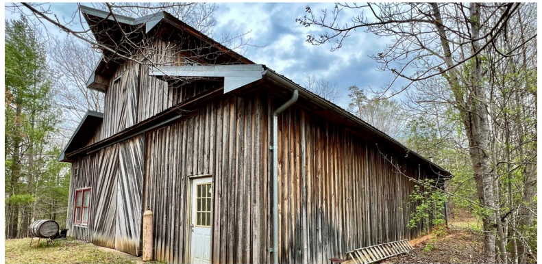
7600 Celt Rd., Stanardsville, VA 22973 (Greene County)