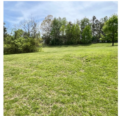
2331 Orange Rd., Pratts, VA 22731 (Madison County)

This press release can be viewed online at: https://www.einpresswire.com/article/711959690