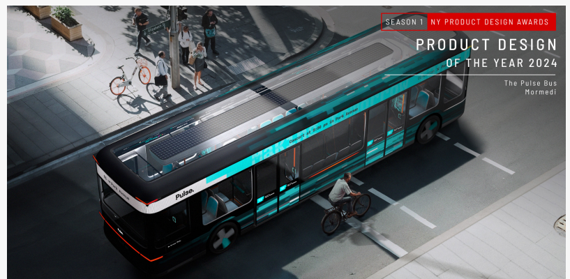
S1 Product Design of the Year - The Pulse Bus by Mormedi