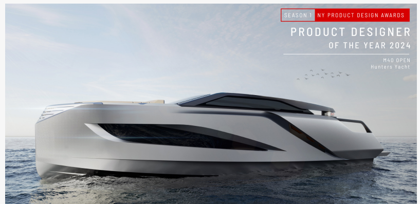
S1 Product Designer of the Year - M40 OPEN by Hunters Yacht