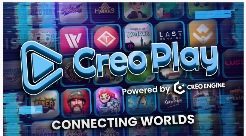
Creo Engine: Empowering The World Through Web3 Gaming