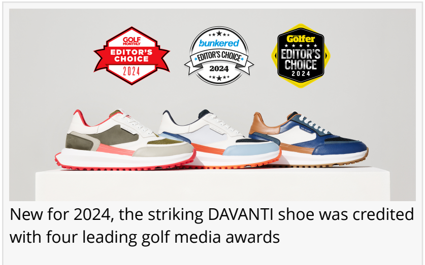
New for 2024, the striking DAVANTI shoe was credited with four leading golf media awards

BREUKELEN, THE NETHERLANDS, May 16, 2024 /EINPresswire.com/ -- Luxury Italian golf fashion brand Duca del Cosma has seen seven of its premium handcrafted golf shoes sweep up in the sought-after 'Best Of' listings and 'Editor's Choice Awards' from leading golf media publications and websites in the U.S. and UK.