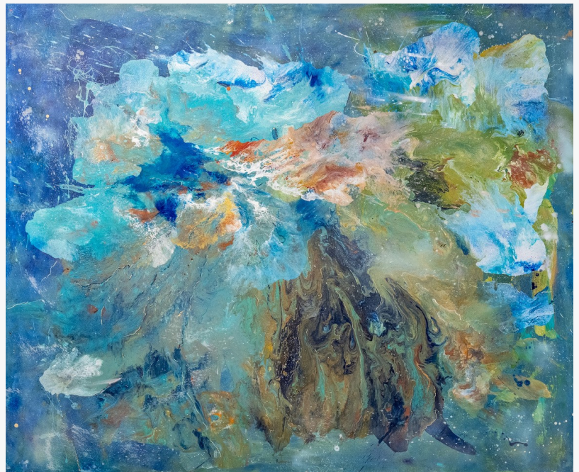
Fairytales Under the Milky Way