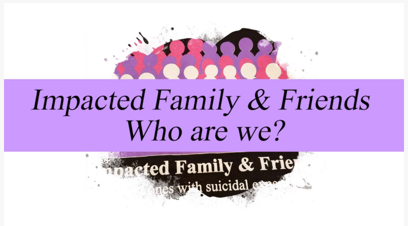
Impacted Family & Friends