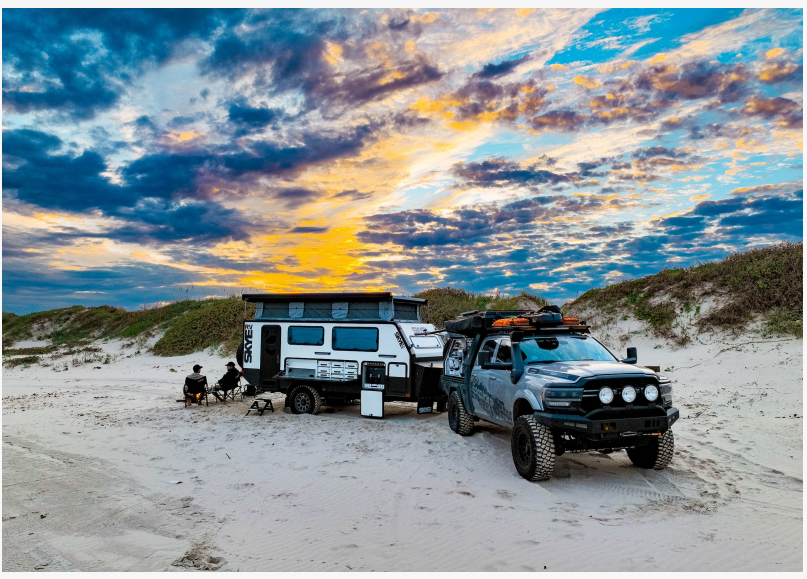
Get an early preview of what's arriving in the U.S. late 2024! This 14-00 hybrid is already hitting the dirt in the US, and will be accompanied by the 11, 16, 18, and 21 ft models by end year.

enough sleeping area for a family of up to 7, and all around 3,500 lbs.