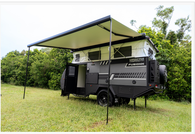
The Fusionn is one of the newest hybrid caravans from Australia, now available in the U.S. - the Iconn E2E and the Fusionn hybrid. The Fusionn features a Cruisemaster air suspension, Victron power, bunk beds and internal ensuite – Australian lux in a 5,000 lb. hybrid.

Atlas Outdoors' TetonX — The 100% U.S. made TetonX hybrid has been relaunched in 2024 with XGRID Campers. The new configuration comes standard with air suspension, Truma furnace, and Victron charging. Add on a 12v rooftop A/C, 490W Solar, and 270Ah Battleborn LiFePO4 batteries and campers can travel in comfort, with