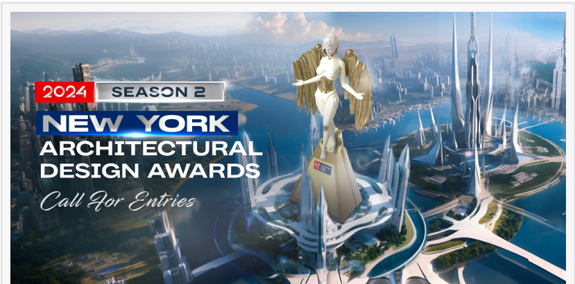
2024 NY Architectural Design Awards S2 Call for Entries

The competition is honored to work with an esteemed group of jurors, consisting of