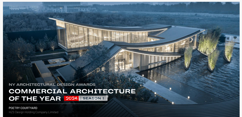
S1 Commercial Architecture of the Year - POETRY COURTYARD by HZS Design Holding Company Limited