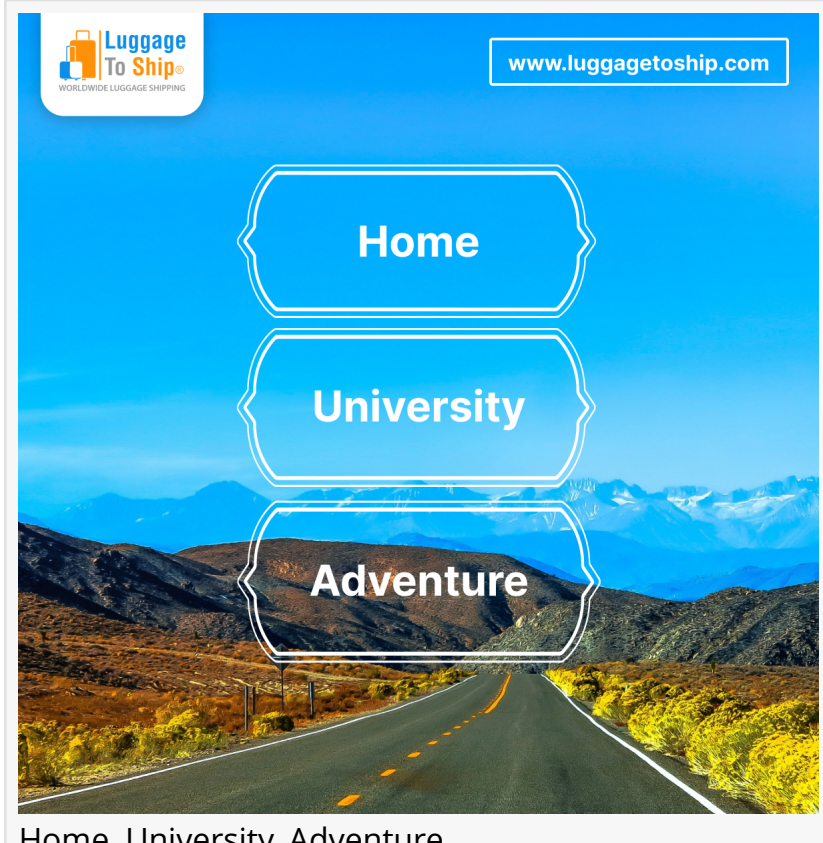
Home, University, Adventure

Innovative Payment Solutions LuggageToShip.com has integrated PayToMe.co's Al-driven digital payment solutions and patented Text-to-Pay technology into its platform. This allows customers to complete transactions securely and effortlessly