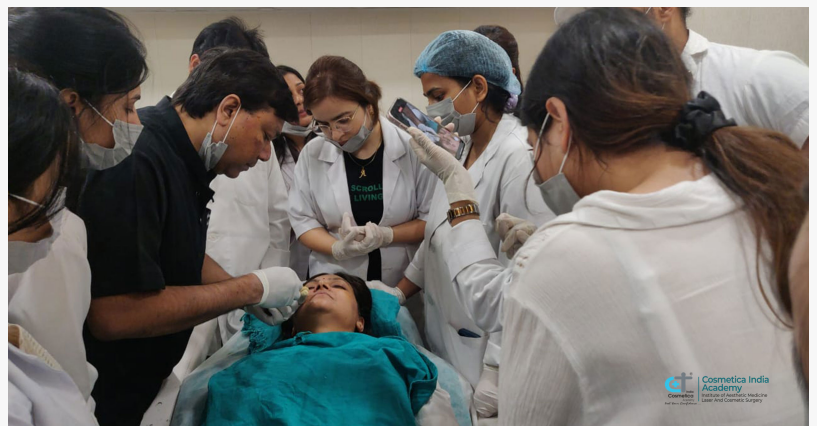
Cosmetica India Academy empowers doctors with the art of cosmetology

Fond of their art and proud of their creativity, Cosmetica India Academy is managed by the leading experts of the industry, and these professionals continuously research and keep