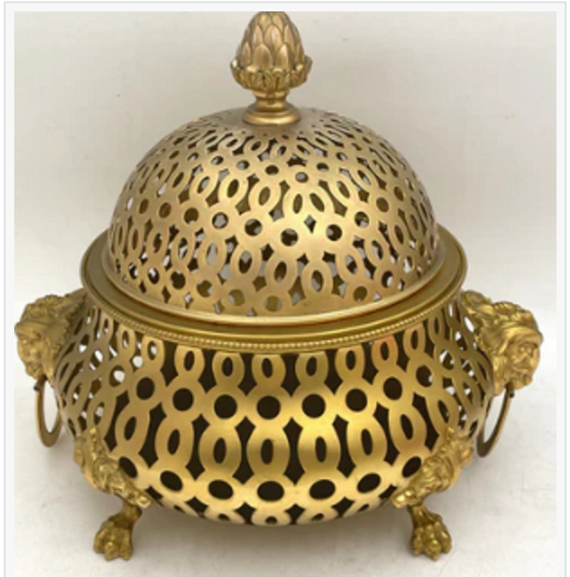
Tiffany & Company gilt sterling silver rose centerpiece bowl, beautifully adorned with a finial, two lions and with a pierced, geometric design, on 4 clawed feet (est. $4,900-$7,000).

The Tiffany & Company gilt sterling silver rose centerpiece bowl is beautifully adorned with a finial, two lions and with a pierced, geometric design, standing on 4 clawed feet. It was made in the mid-20th century in Italy and measures 13 inches from handle to handle by 11 ½ inches in depth. It weighs 121.5 troy ounces and bears hallmarks. The estimate is $4,900-$7,000.