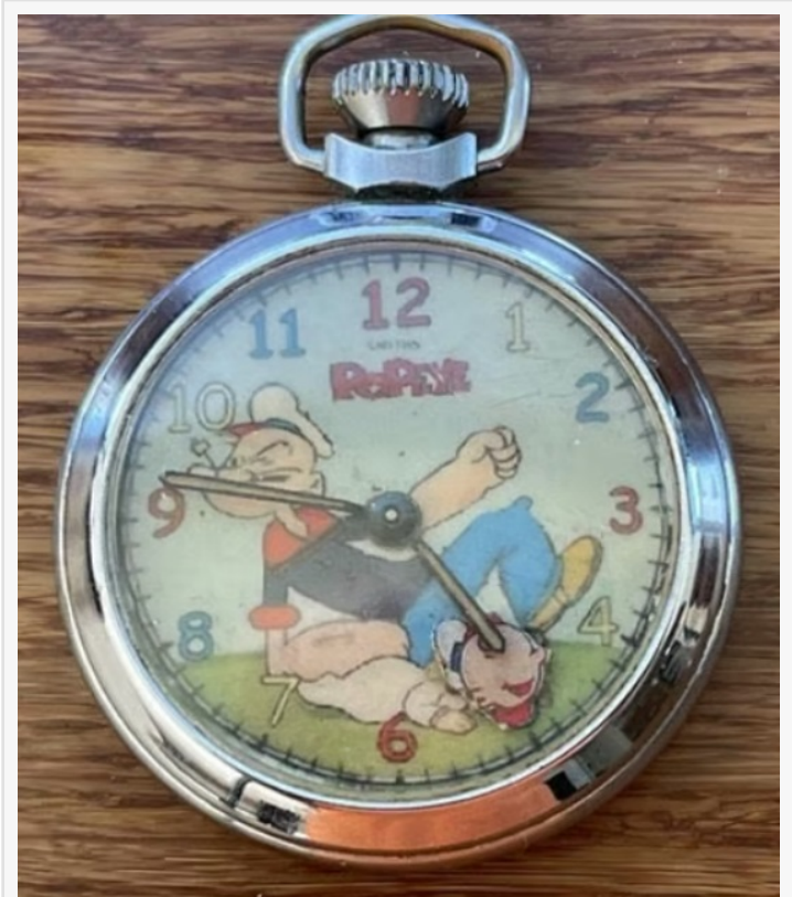
Popeye is enormously popular with collectors and SJ Auctioneers has featured many Popeye items in past sales. This working 1960 pocket watch has an estimate of $300-$750.

On to decorative accessories, which include a Daum pate de verre (opaque, dense glass having a