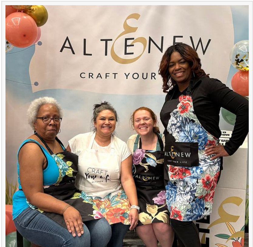
Crafters try out the new Artsy Aprons at the Go Wild conference in Texas.

The highlight of this month's release was the new collection of Artsy Aprons. In the world of crafting, stains on clothes are a common casualty. But with the introduction of Artsy Aprons,