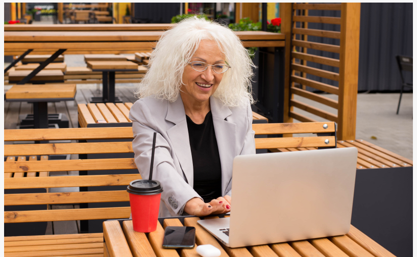
Business Owner fill DBC Refund PAF Form

One of the key advantages of the DBC Refund PAF is its simplicity and efficiency. Small business