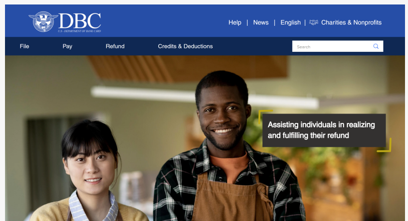
DBC Refund PAF - Official Website of US Department of Bank Card