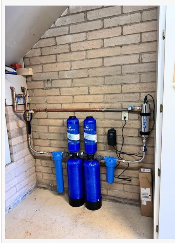
Super Brothers Filters 2