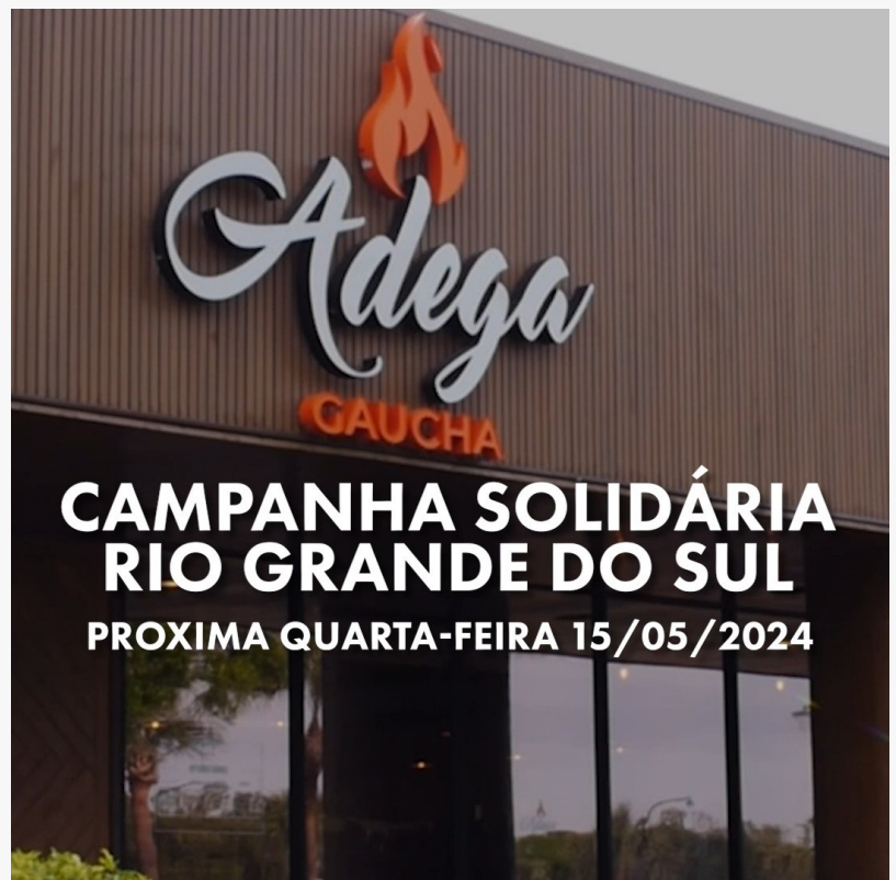
Rio Grande Do Sul Solidarity Campaign | Adega Gaucha's Team