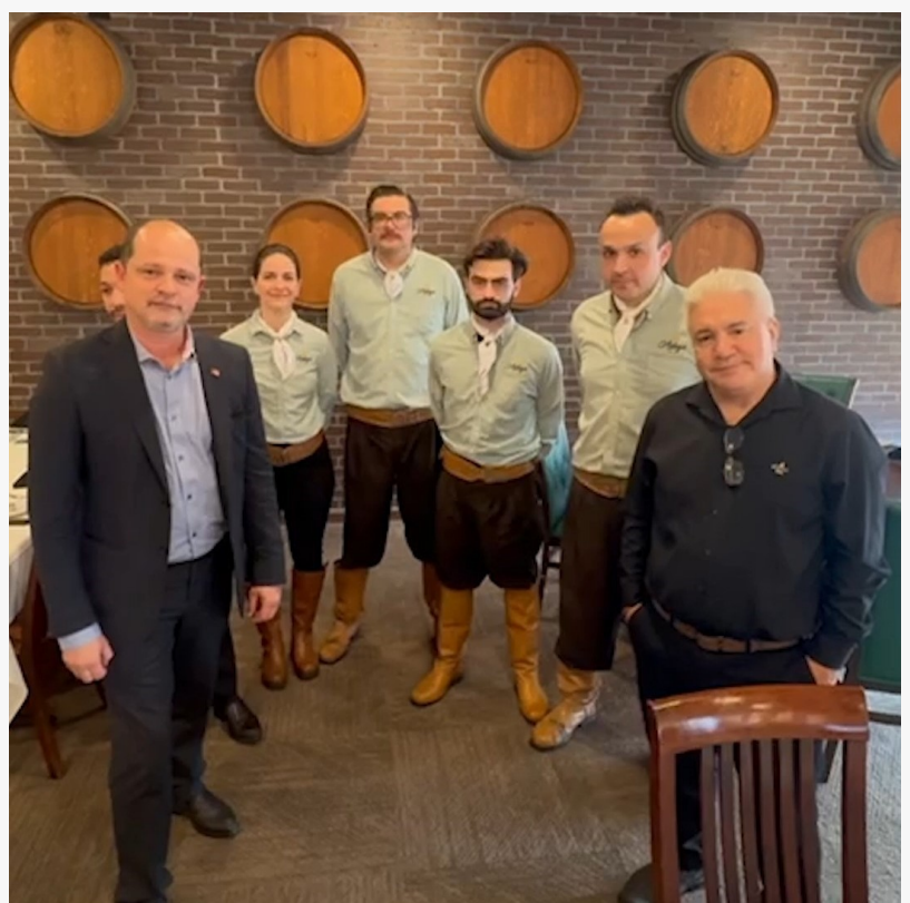
Rio Grande Do Sul Solidarity Campaign | Adega Gaucha Brazilian Steakhouse, Orlando, FL

Facebook Twitter LinkedIn Instagram YouTube TikTok