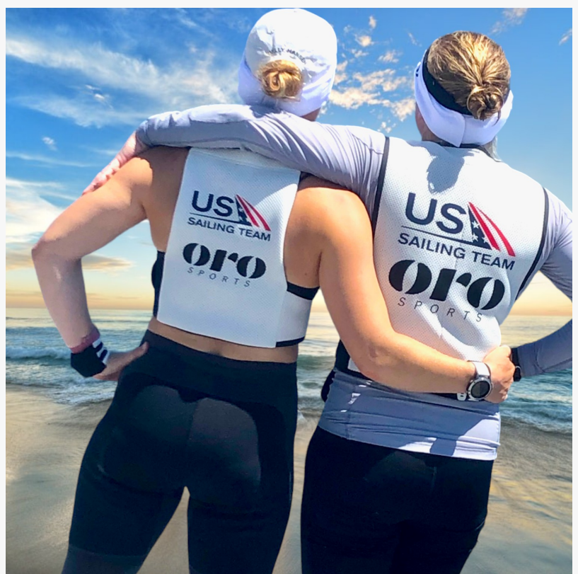
Ultimo Cool Vest on Sailing Team

The Ultimo Cool Vest is just one of several cooling garments offered by Oro Sports that allow you to get on with your activities or rest without risk of heat fatigue, or worse. The garments transfer body heat away from the body while also cooling the skin and blood to keep body temperature from rising. These are unlike evaporative cooling methods (as with cooling towels, shirts, and misters) that require low humidity and circulating air to perform, not nearly enough cooling to compete against the record-breaking heat faced by our nation each summer.