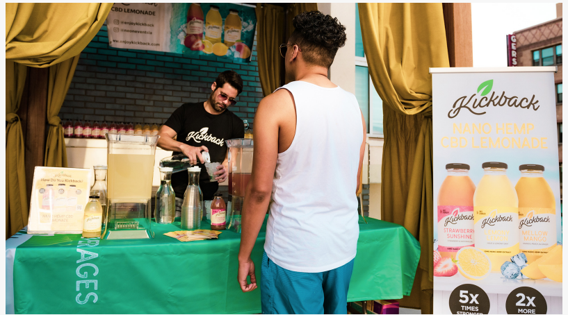
Food and Beverage Booth Design