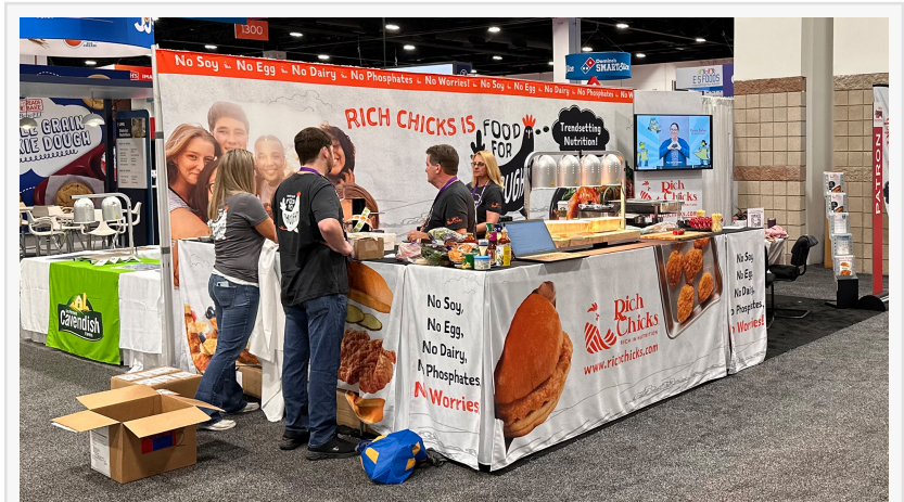
Trade Show Booth Design Las Vegas Nevada

/EINPresswire.com/ -- Mad Mind Studios, a premier creative branding, web design, and digital marketing agency based in Los Angeles, is revolutionizing the trade show experience for food industry companies. Specializing in custom graphic design services, Mad Mind Studios is helping food distributors, manufacturers, wholesalers, and related brands stand out at trade shows with visually stunning booth designs, banners, and comprehensive printing services.