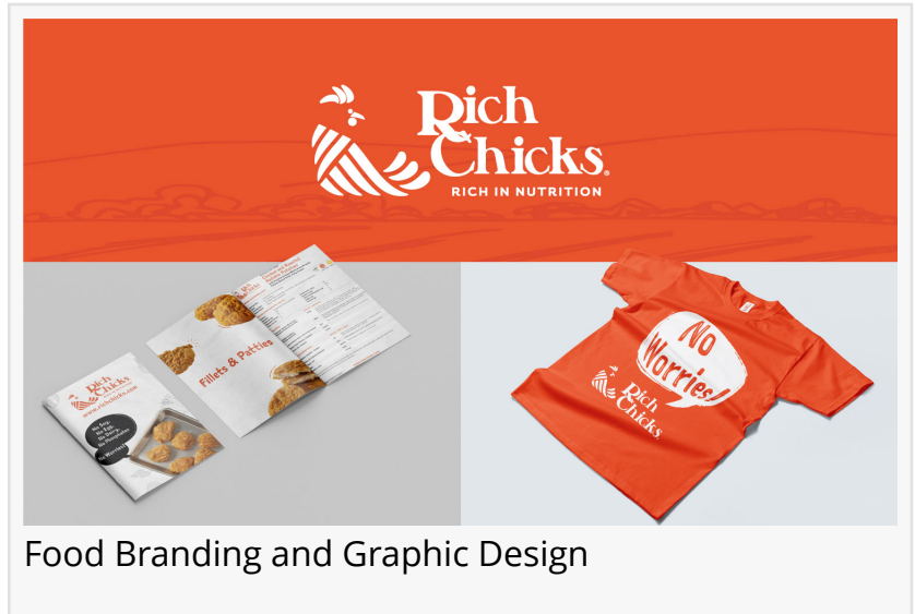
Food Branding and Graphic Design

“Our booth was a standout at the trade show, thanks to the incredible designs by Mad Mind Studios,” said the distributor’s marketing director. “The visuals were not only stunning but also effectively communicated our brand’s commitment to quality and sustainability.”