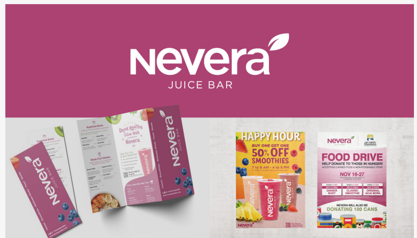
Juice Bar Graphic Design