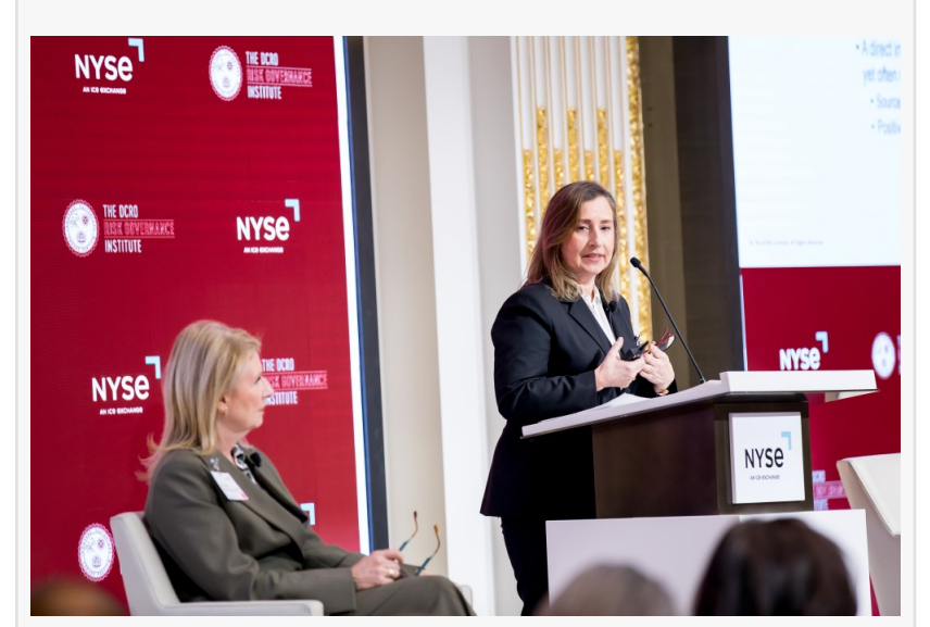
NYSE DCRO Institute Event 2024