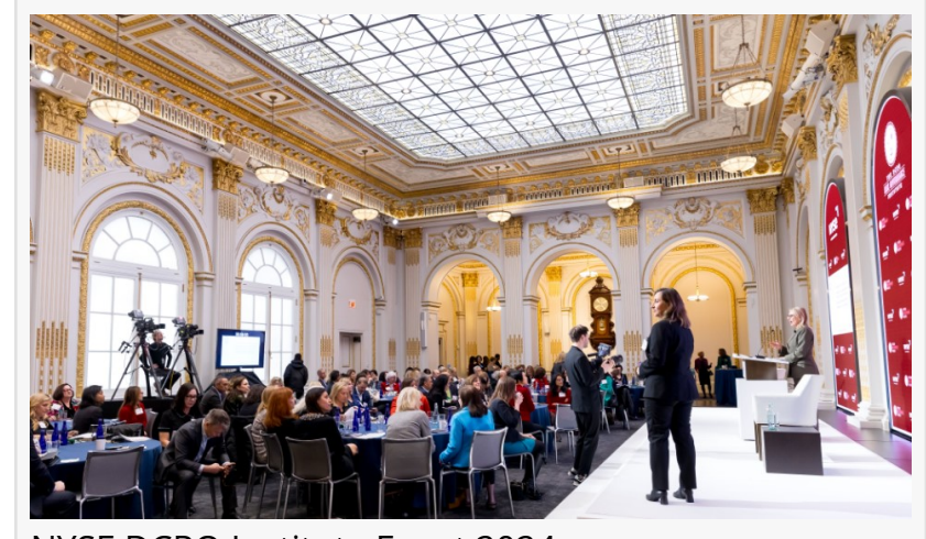
NYSE DCRO Institute Event 2024