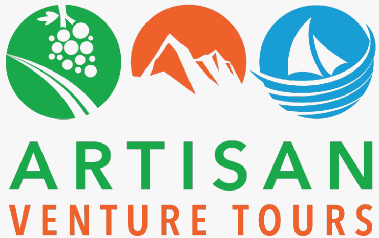
Artisan Venture Tours

Guests from Gamma Technologies, a simulation software engineering company and client of AVT, arrived from all over the world on April 26 to spend time with