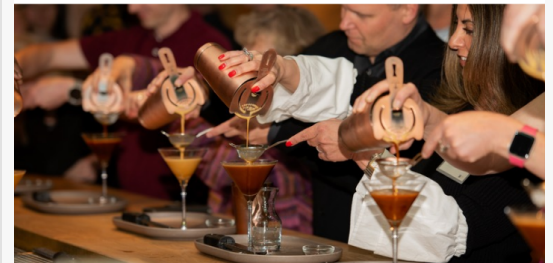
Images from AVT client event at Starbucks Reserve Chicago Roastery.