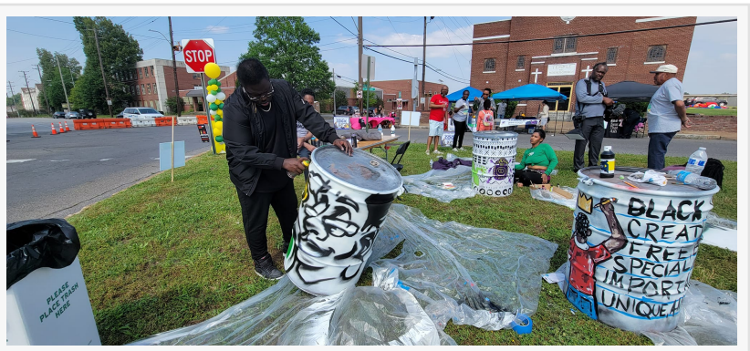
The inaugural year included live barrel art demonstrations by local creators. Children were encouraged to join in the fun.