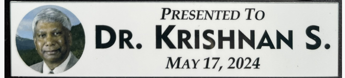
Outstanding Asian American Award - back