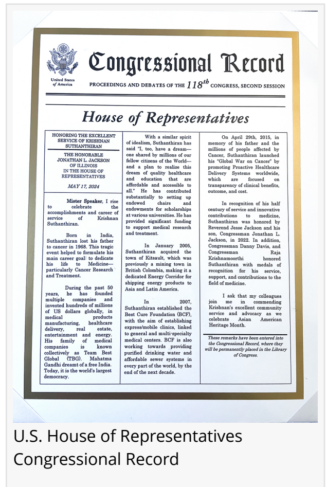
U.S. House of Representatives Congressional Record

physics, radiation therapy, blood irradiation, vascular brachytherapy, imaging, medical particle acceleration, cyclotrons, and proton-to-carbon heavy ion therapy systems. TeamBest is the single source for an expansive line of life-saving medical equipment and supplies. Its trusted team is constantly expanding and innovating to provide the most reliable products and technologies.