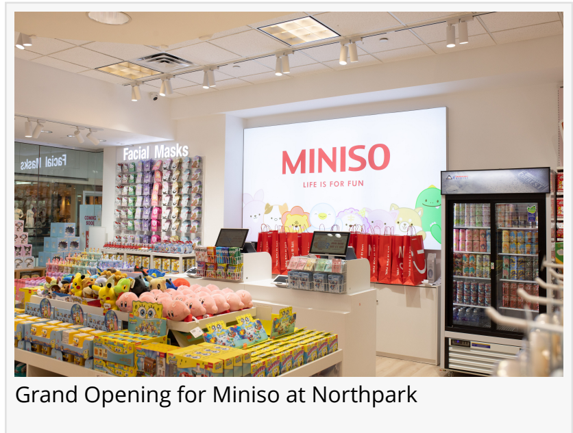
Grand Opening for Miniso at Northpark

Mississippi, Northpark combines contemporary architecture and design with next generation technology and Southern charm. Conveniently located less than one mile east of I-55 at the intersection of County Line & Wheatley Roads, Northpark features Dillard's, JCPenney, Belk, H&M, B&B Theatres, Victoria's Secret, Windsor, Pac Sun, and Buckle and over 50 locally owned businesses. For additional information, stop by https://visitnorthpark.com/ or follow social media at: Facebook: https://www.facebook.com/ShopNorthparkMS/ Instagram: @ShopNorthparkMS #NorthparkNostalgia #NP40YearsofStyle