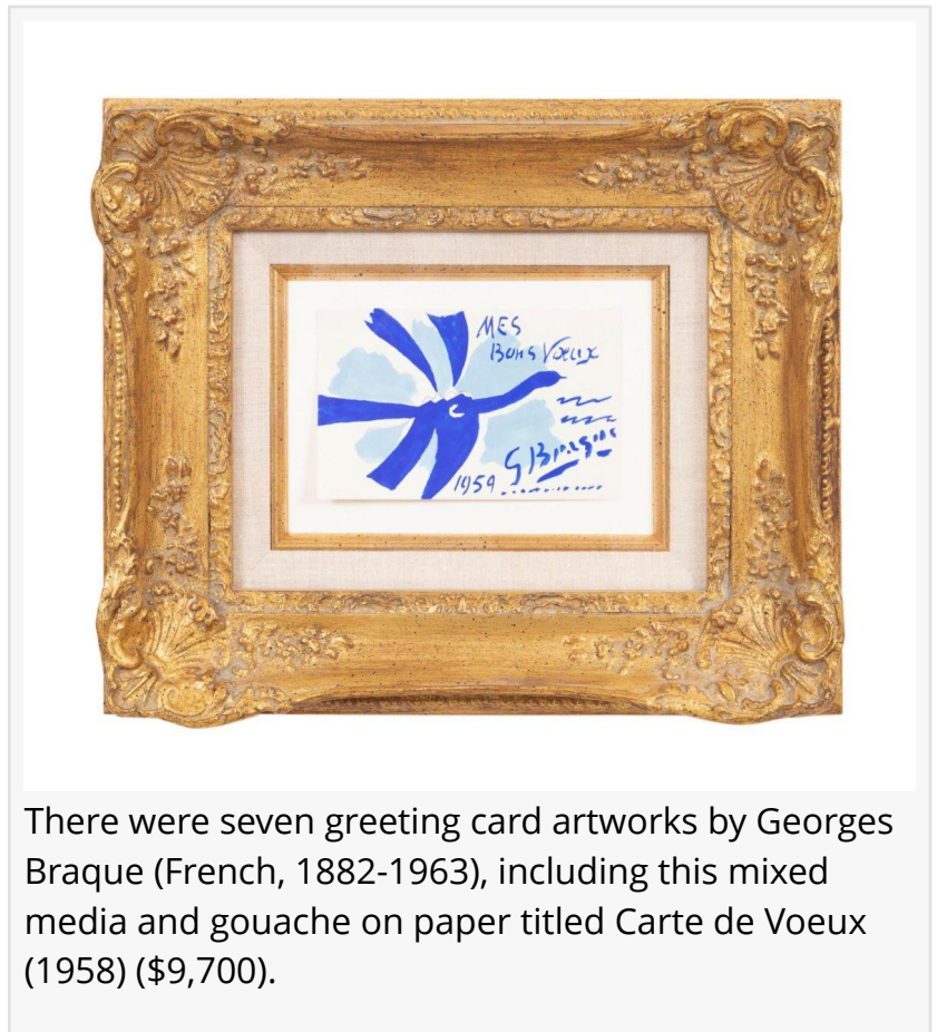
There were seven greeting card artworks by Georges Braque (French, 1882-1963), including this mixed media and gouache on paper titled Carte de Voeux (1958) ($9,700).

There was more than one Chagall artwork up for bid. A circa 1979 color lithograph on paper by the artist, titled Le Petit Acrobate Rouge (The Little Red Acrobat), pencil signed lower right and numbered ("6/50"), and with a Mourlot Paris stamp to the lower left, changed hands for $5,100.