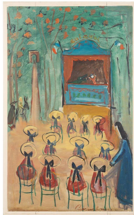
Oil on canvas laid to board by Ludwig Bemelmans (Austrian-American, 1898-1962), titled Puppet Show. It was one of three Belemans in the auction, all of which bested high estimates ($57,500).

Returning to fine art, several works by Pablo Picasso (Spanish, 1881-1973) crossed the auction block. A Chope visage (A.R. 434) painted earthenware ceramic jug (or pitcher), #94 from an edition of 300 that was conceived in