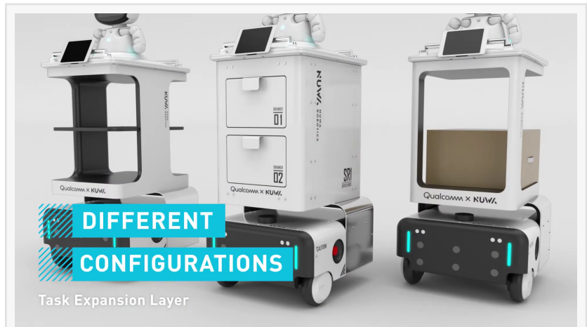
Navia Robotics Hospital Robots - Different Configurations

Research and Development: The partnership will invest in joint R&D initiatives to push the boundaries of service robotics. This includes exploring new applications, improving existing technologies, and ensuring the highest standards of safety and reliability while tackling scenarios others find too challenging.