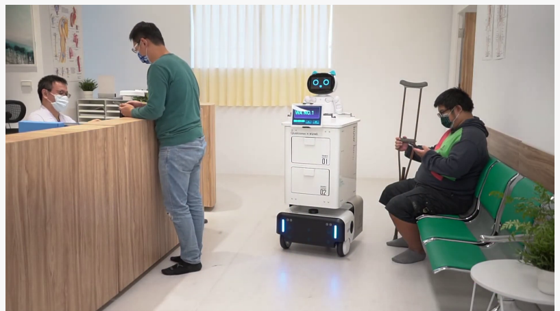
Navia Robotics Hospital Robots - Medical Facility