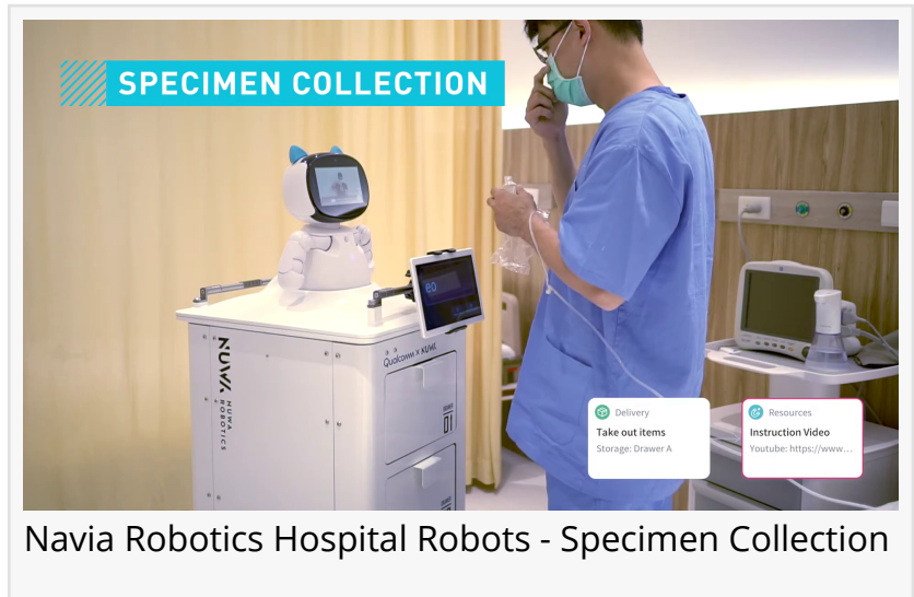
Navia Robotics Hospital Robots - Specimen Collection

/EINPresswire.com/ -- Navia Robotics and Nuwa Robotics, two leading innovators in the field of service robotics, are excited to announce a strategic partnership aimed at transforming the hospitality and healthcare industries with advanced robotic solutions. This collaboration combines the strengths and expertise of both companies to deliver state-of-the-art service robots that enhance operational efficiency, guest experience, patient service and care.