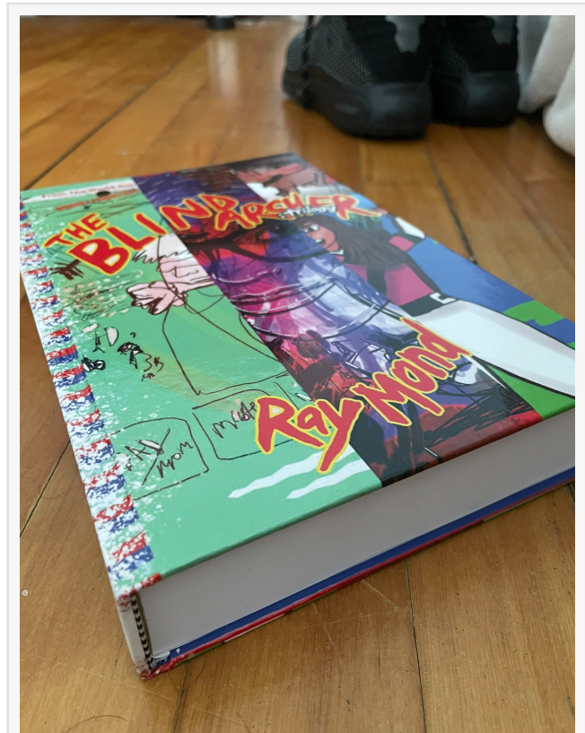
The Blind Archer Trilogy Book

This press release can be viewed online at: https://www.einpresswire.com/article/713283878