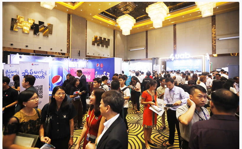
2024 JobNet JobNATION Yangon - Event Crowd