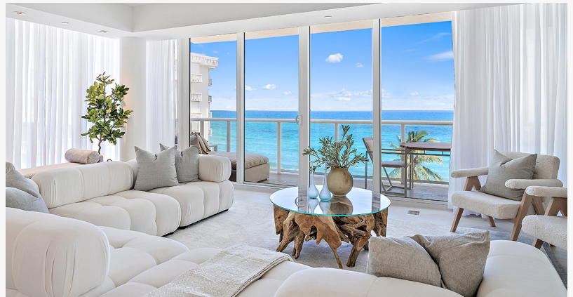
3550 South Ocean Boulevard, 5B, South Palm Beach, Florida