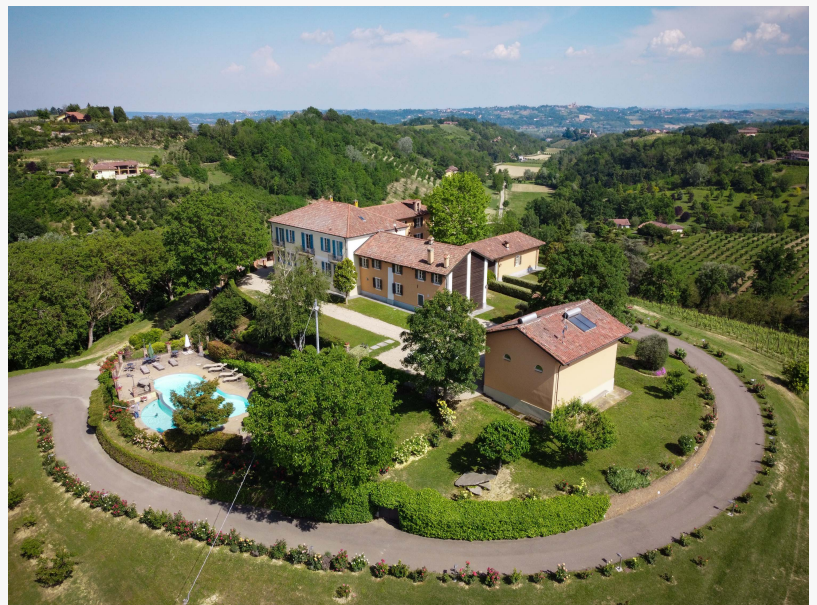
'Azienda Agricola Montefiorito', Asti, Monferrato Region, Italy

'Important Global Properties' further coincides with Sotheby's exhibitions of its Modern British &