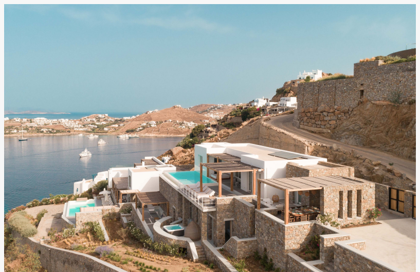
'Silk Shadow', Mykonos, Greece

/EINPresswire.com/ -- Curating the very best-in-class, Sotheby's Concierge Auctions is proud to present nearly US$50 million in marquee offerings in its 'Important Global Properties' collection as it continues to set new benchmarks for the industry. As part of its inaugural sale at Sotheby's London, featuring a curation of Sotheby's International Realty listings representing some of the finest properties available from across the globe, bidding will close between 17-24 June via the firm's online marketplace . Held as part of Sotheby's 'The Luxury Sales,' a series spanning Hong Kong, London, Paris, and New York, properties will be on public view at Sotheby's New Bond Street location beginning 24 May, displayed alongside fine art, jewelry, watches, designer handbags, and more. This unique integration highlights the seamless blend of modernity and tradition that defines the Sotheby's brand.