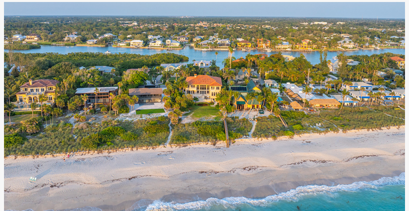
507 Casey Key Road, Nokomis, Florida