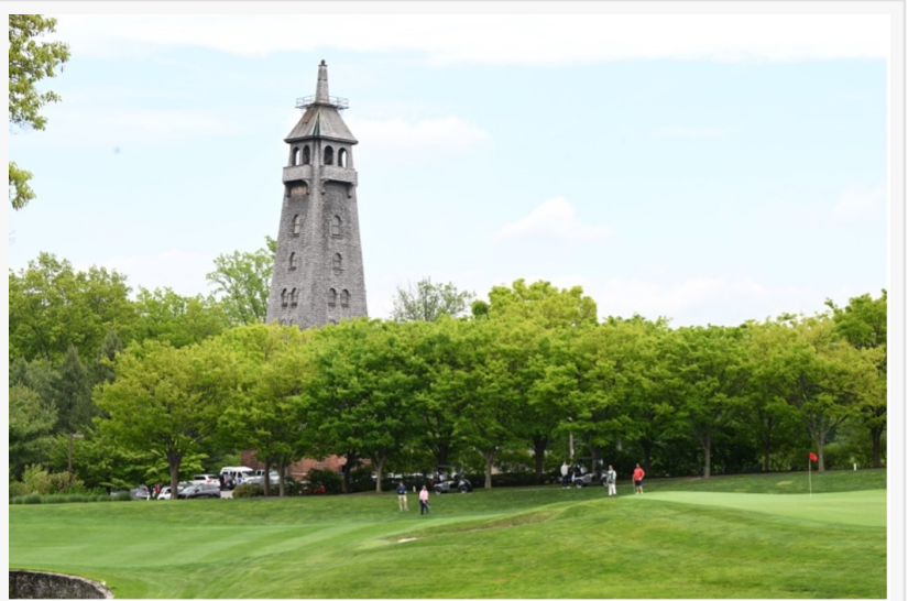
Atmosphere

The organization has continued to grow in New York City, as well as Nassau and Suffolk Counties on Long Island.