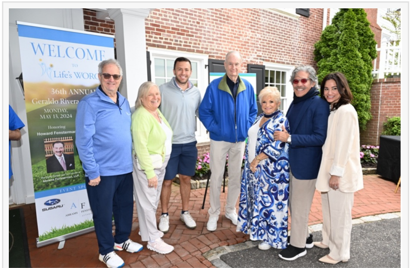
Guests, Bill O'Reilly, Victoria Schneps, Geraldo Rivera, Erica Rivera

These powerful reports are credited with ending America's policy of institutionalizing the developmentally disabled, leading to government investigations, institutions across the nation being eventually shut down and the civilized world adopting small, community-based housing as the alternative. The subsequent sea change in the treatment of the mentally disabled is considered by Geraldo to be his most important life's work.