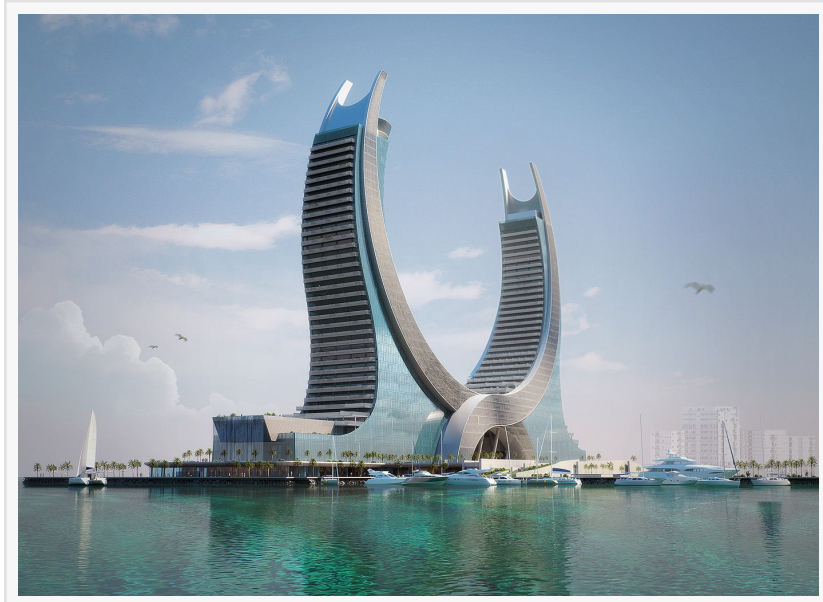
THE ICONIC twin towers of Doha, Qatar, first welcomed guests for the 2022 World Cup.

Terrazzo is a composite material developed in 15th-century Italy, a descendant of the mosaic artistry of Ancient Rome. It evolved as a sustainable building system as resourceful Venetian marble workers discovered a creative way to reuse discarded stone chips. Terrazzo artisans still pour terrazzo by hand on the construction site, with options for precast and waterjet-cut elements. Stone, recycled glass, or other aggregates, often sourced locally, are embedded in a cement or epoxy base