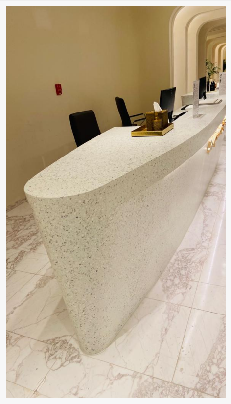
SEAMLESS precast terrazzo clads the hotel's reception desks.

The NTMA's annual Honor Award program recognizes outstanding terrazzo projects its members submit. The program promotes member contractors as the sole qualified resource for terrazzo installations that meet industry standards. Terrazzo veterans and design professionals evaluate the submitted entries.