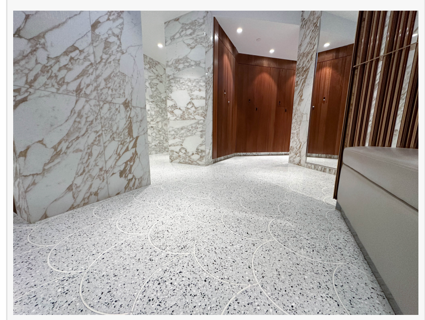
THE HOTEL'S interior design was inspired by super yachts.

The NTMA is a full-service nonprofit trade association headquartered in Fredericksburg, Texas. Founded in 1923, the NTMA establishes national standards for terrazzo systems for floor and vertical applications. Its mission is to promote quality craftsmanship and creativity in terrazzo while supporting its 152 members in their trade and service to the construction industry.