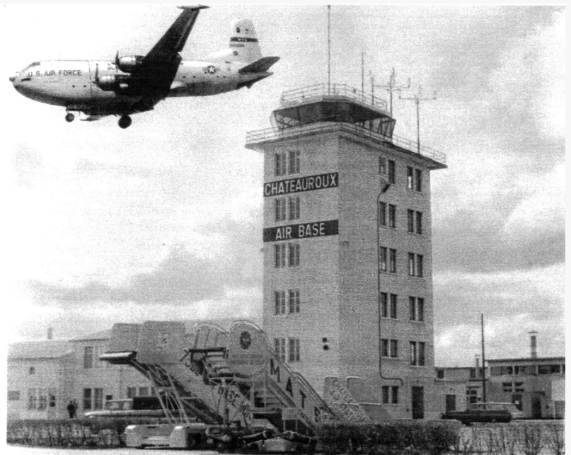
CHAS Control Tower