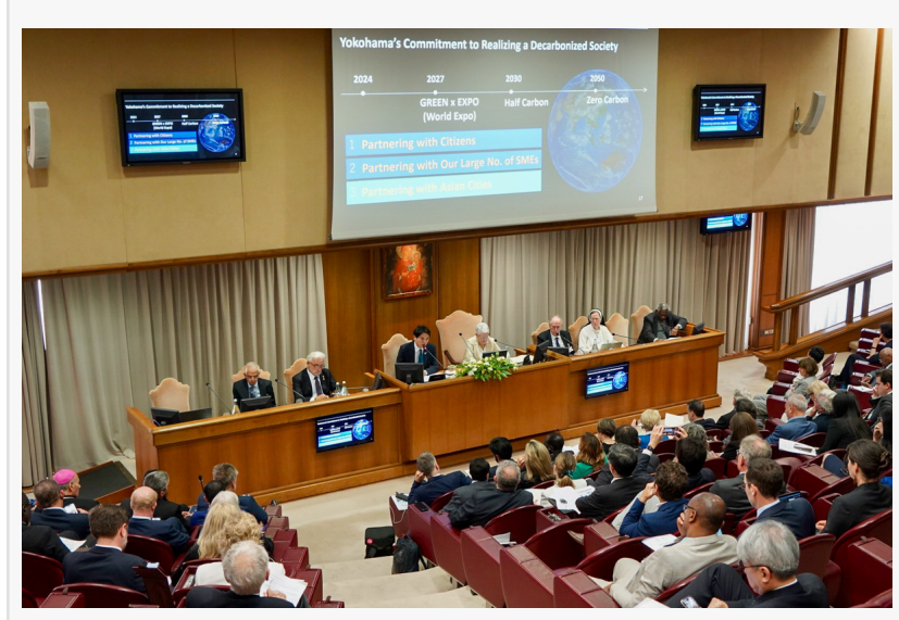
Mayor Yamanaka of Yokohama presenting in front of other leaders at Vatican summit

waste management system focusing on guidelines for a more detailed separation of plastic are expected to contribute to a 15% decrease in CO2 from plastic incineration by next year.