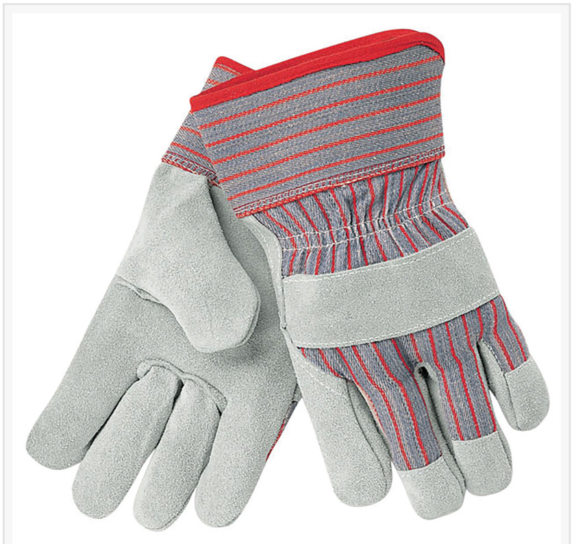
KBC Part # 1-700-001, Leather palm gloves with rubber cuffs

General Utility Gloves: When it is necessary to protect one's hands from the daily wear and tear of working with rough, oily, and sharp materials, these gloves give the flexibility to get the job done, They come with touchscreen technology, because nowadays one is never far from a smart device, they are machine washable, breathable, reinforced where wear traditionally occurs, and have a convenient hook and loop wrist adjustment so that they fit comfortably and snugly. These gloves are designed for demolition, fabrication, automotive, construction, general maintenance, and order picking. Name brands include: MCR Safety, Milwaukee, Legacy, and Ironclad.