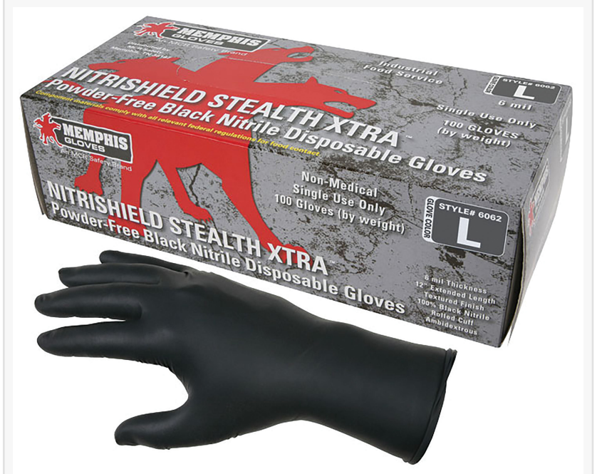
KBC Part # 1-711-6062L, Large Nitrishield stealth gloves with roled cuffs